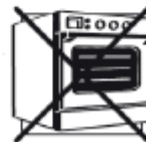
Traditional oven, infrared oven and multi purpose oven

The recipient should pay particular attention to any change in the packaged product, its intended use and also to any modification in the material's processing conditions and make sure that the contents and packaging are compatible, as directed in this declaration.