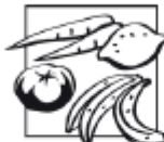
Fruit, vegetable and frozen product